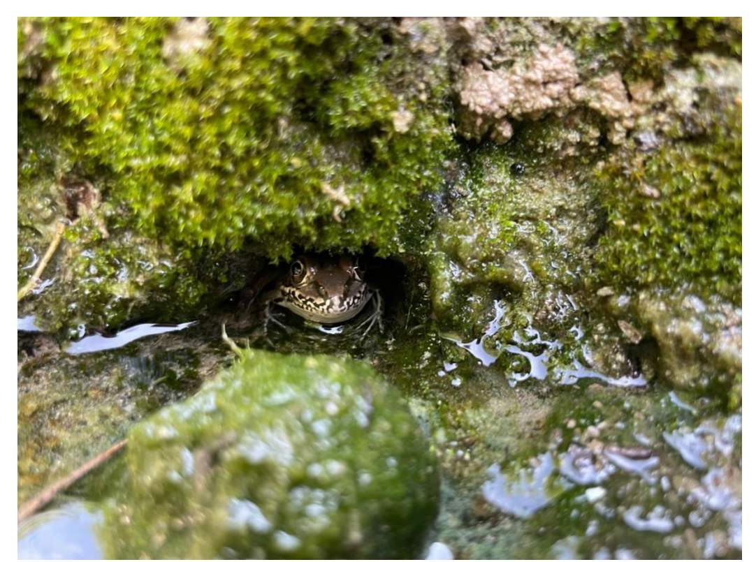
Rio Grande Leopard Frog near Helotes Creek<sup>16</sup>

Considering this richness of species, Helotes Creek through the City of Grey Forest should not have been categorized as subject to limited aquatic life use.